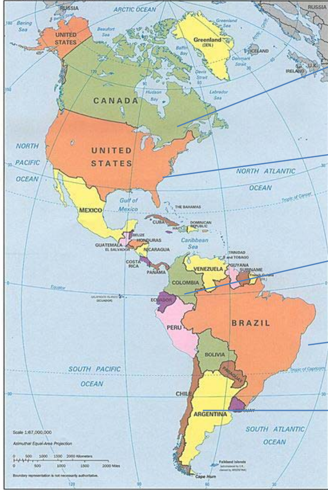
North and South America