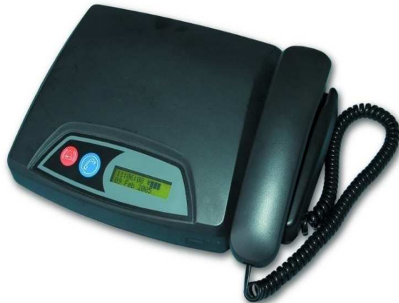
Monitoring Unit (MU) (Home Detention Curfew)