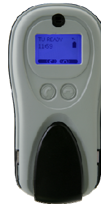
Tracking Unit (TU) (Satellite Tracking)