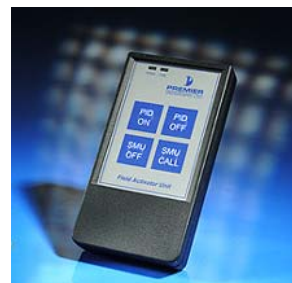
Field Activator Unit (FAU)