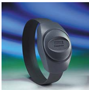
Personal Identity Device (PID)