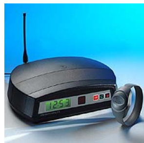
Site Monitoring Unit (SMU)