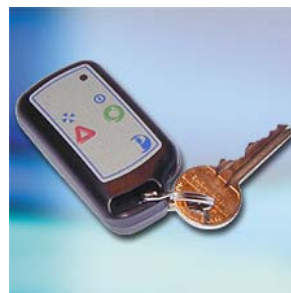
Monitoring Officers Transmitter (MOT)