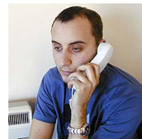
Voice Verification (VV)