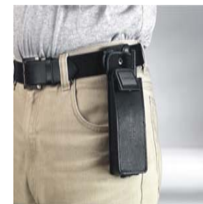
Personal Tracking Device (PTD)