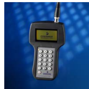
Field Management Unit 2 (FMU2)