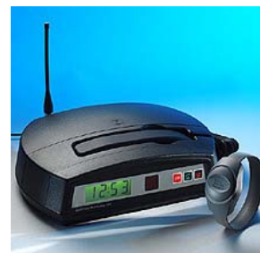
GSM Site Monitoring Unit (GSMU)